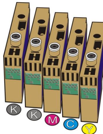
Individual Ink Cartridge configuration