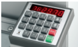
The "EP" back gauge control module features a digital display and keypad for programming.